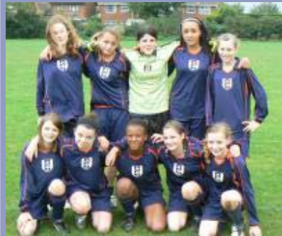
Thorplands girls on the pitch

Shortlisted for New Social Enterprise Award