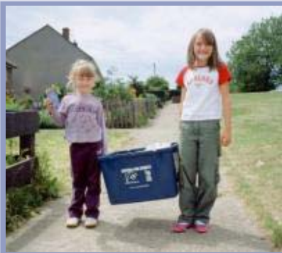
Young recyclers in Newport