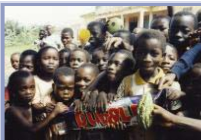
Children in Ghana celebrate the income brought in by the co-op's chocolate