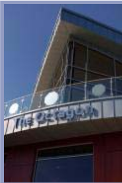
The Octagon conference facility