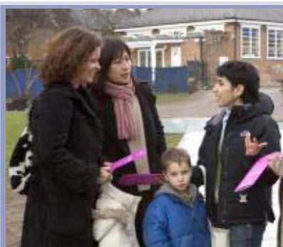
Mums get career advice at the school gates

Shortlisted for New Social Enterprise Award