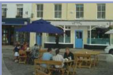
Impressions cafe restaurant