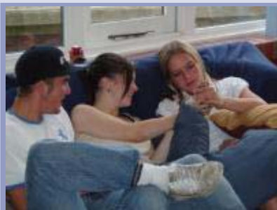
Young people relaxing at Unique Coffee Bar