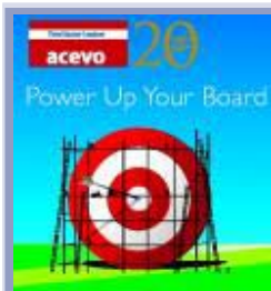
The Power Up Your Board tool

Acevo has developed an online tool to assess the performance of charity boards in an attempt to tackle the lack of confidence in third sector governance.