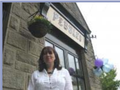
The Pebbles Cafe

Shortlisted for New Social Enterprise Award