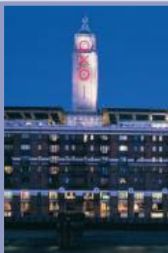
The Oxo Tower