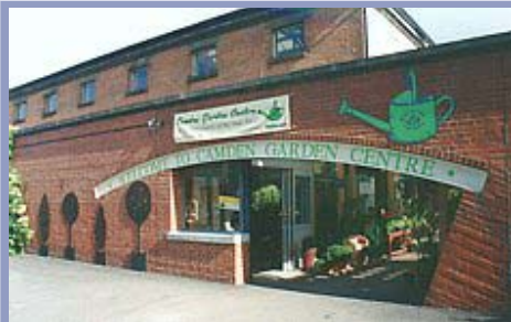
Camden Garden Centre