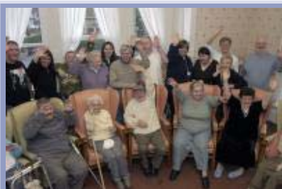
SCCT service users