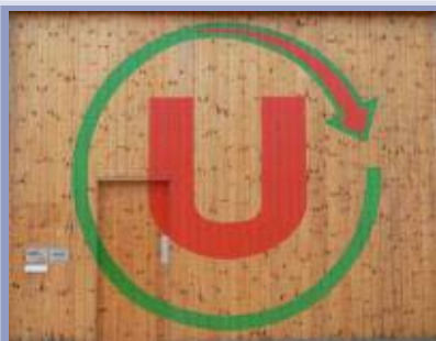
Unique Scrap Store

Unique Scrap Store has been nominated for the Most Innovative Green Product award in the Green England Awards 2007. The awards showcase success and innovation within green and ethical organisations. The winners are decided based on a public vote which runs until December 5. Unique Scrap Store is a social enterprise which uses its profits to help support young people in Newark.